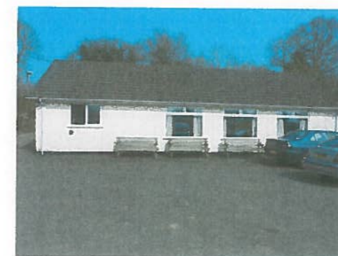
The Church Hall