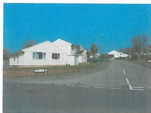
Andrews Way Hatt

Name and Population. The name has now evolved into Botus Fleming and there are a lot more people and a lot more houses in the parish - 310 households and 650 names on the electoral register. Most of the new housing development has taken place on the Hatt side of the A388 on the Sunnybanks Estate while on the Botus side there has been a certain amount of infill plus some barn conversions and the stables and coach house at Moditonham, the Chapel and the School have also been converted to private houses . A limited amount of development is ongoing.