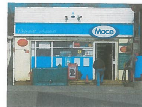
Hatt shop/Post Office

Other organisations include a Women's Institute and the Bohatus Club for older residents although there are no specific age restrictions and the Bell Ringers continue to flourish. After the school was closed it became a church hall and was used for various social events until it was replaced by the present purpose built Church Hall which has recently been refurbished thanks again to a lot of voluntary effort.