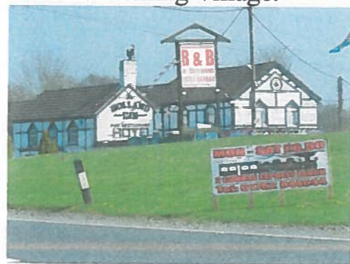
The Holland Inn