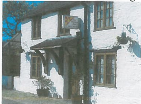
The Rising Sun

Unlike the Parish of the past with its church, chapel and four ale houses now although the church survives the chapel has closed . However after death of the Rector in 1969 the parish was merged into the United benefice of Landrake with St Erney and Botus Fleming and the Rector lives in the Vicarage at Landrake while Botus Fleming Rectory was sold off for private occupation. Just two of the licensed premises survive- the Hollands Inn at Hatt and the Rising Sun in Botus Fleming Village.