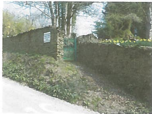
The entrance to the Pound

Food Food was almost entirely locally grown and produced. Fresh meat was scarce so the roast beef dinner Mrs Carpenter gave to the poor to celebrate the victory at Waterloo was a rare treat. Probably much more unusual than the hedgehogs she included for the gypsies. But pigeon squabs were a delicacy reserved for the big houses. The birds were encouraged to breed in the dovecote at Moditonham in recesses in the wall - genuine pigeon holes - and there was a ladder going up the middle of the structure so that estate servants could climb up and collect birds from the nests when required. But Botus was best known for its cherry orchards which lasted until after the second world war and for many years it was known as 'The Cherry Village'