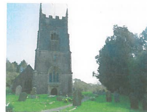
St Mary's Church Botus Fleming

Other organisations include a Women's Institute and the Bohatus Club for older residents although there are no specific age restrictions and the Bell Ringers continue to flourish. After the school was closed it became a church hall and was used for various social events until it was replaced by the present purpose built Church Hall which has recently been refurbished thanks again to a lot of voluntary effort.